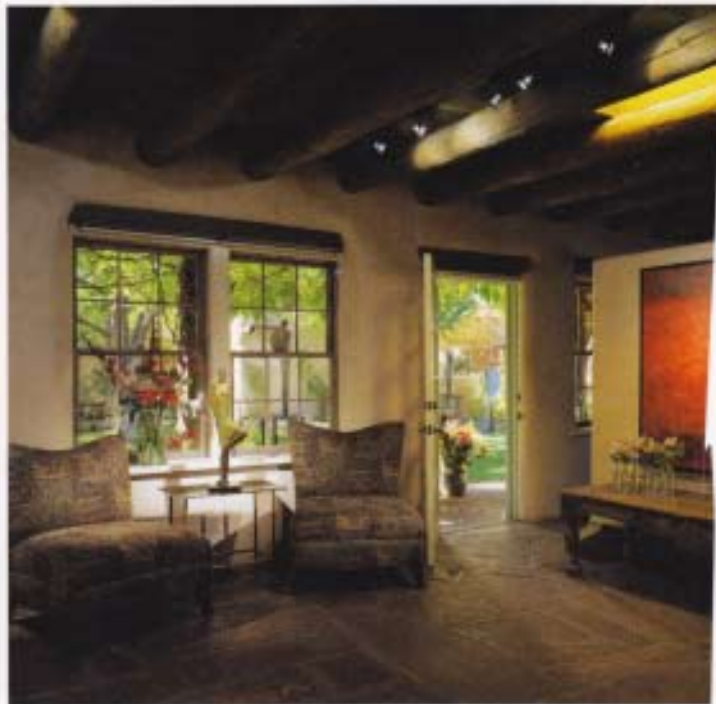
Above: The gallery has outdoor as well as interior space for sculpture, and deliberately limits the number of artists showing at any given time.